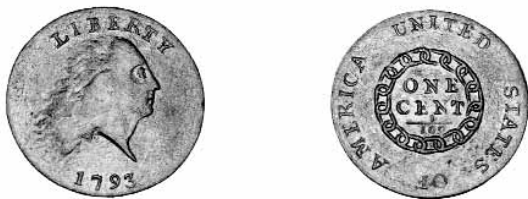
CHAIN REVERSE, 1793

Early date choice Uncirculated Large Cents are extremely rare, although the later dates are only scarce. Coins with full original mint red luster are greatly desired and command a high premium. Numerous die varieties exist because the dies for the early coins were individually made. Large Cents were often poorly made because of low quality planchets. Proof Large Cents were first minted in 1817 and all are scarce and desirable.