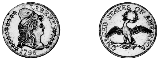
CAPPED BUST, 1795-1798 Small Eagle on Reverse