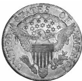
DRAPED BUST, 1801-1807 Large (Heraldic) Eagle on Reverse