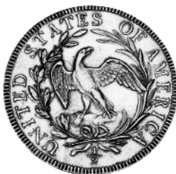
DRAPED BUST, 1796-1797 Small Eagle on Reverse