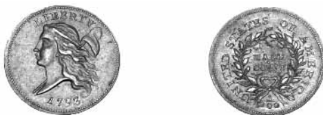
FLOWING HAIR, 1793 Head Facing Left.